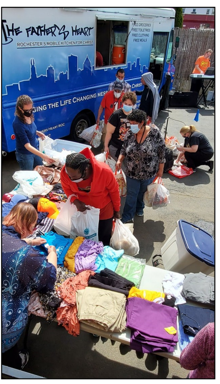
Ladies shop for clothing.

Isaiah 6:8: Also I heard the voice of the Lord, saying, "Whom shall I send, and who will go for Us?" Then I said, "Here am I; send me."