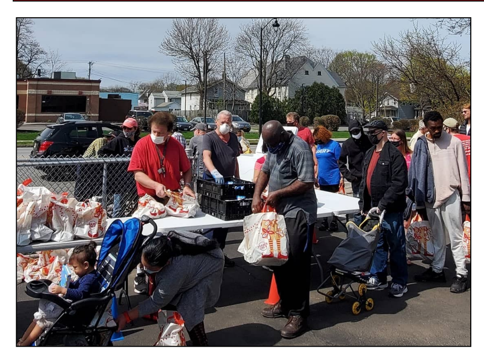
Groceries are distributed during an outreach at the ministry's headquarters.