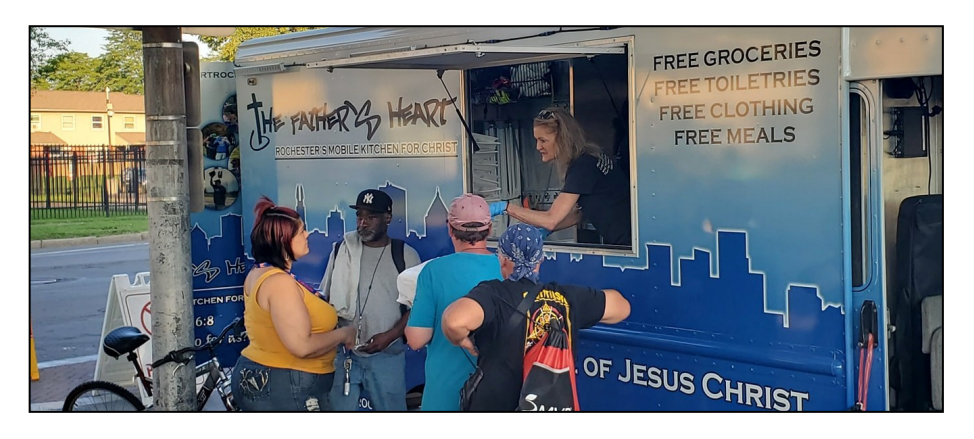
Hot meals are served at North Clinton and Oakman.

thew 11:15, "He who has ears to hear, let him hear!"