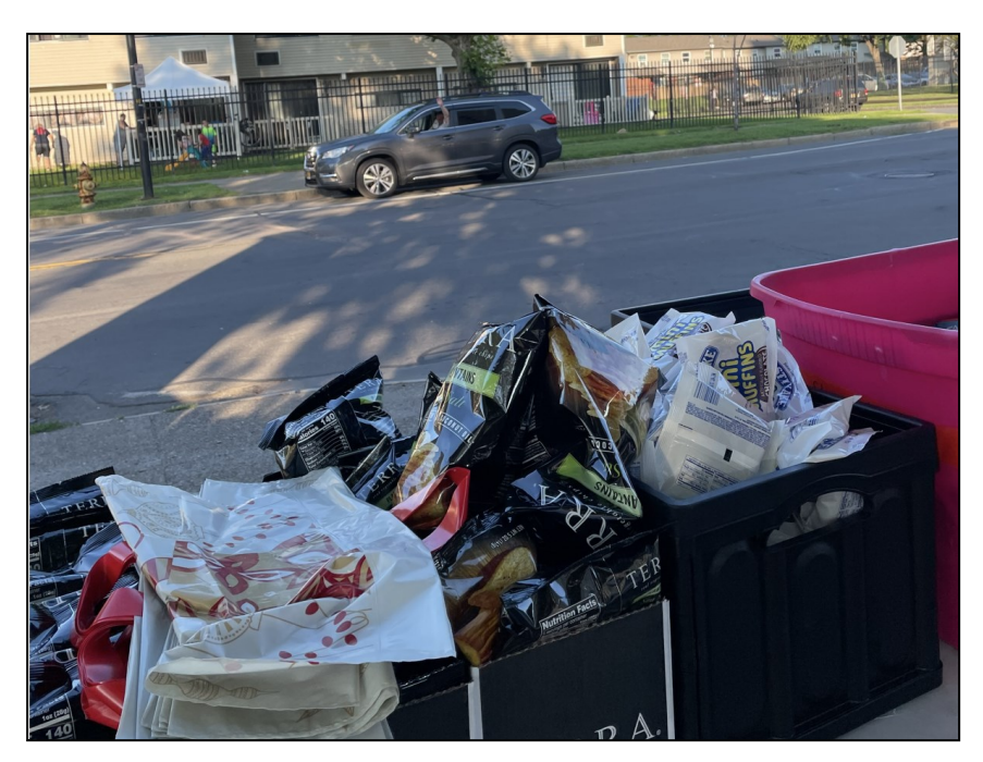
A tearful man in a van across the street raises his arm in prayer.