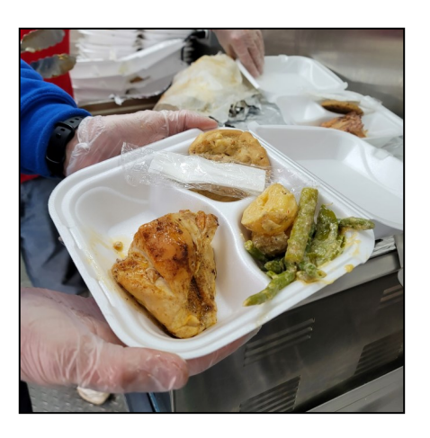
A hot meal is served at the new Cleveland Street outreach site.

WE ALSO have started a new outreach location on the fourth Saturday of the month on Cleveland Street. The first outreach there brought out many, and they heard about Jesus. What a blessing it was, and we are looking forward to what