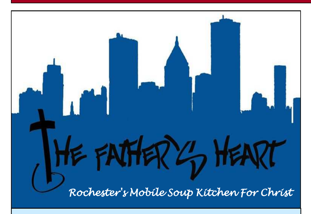
Isaiah 6:8: Also I heard the voice of the Lord, saying, "Whom shall I send, and who will go for us?" Then I said, "Here am I; send me."