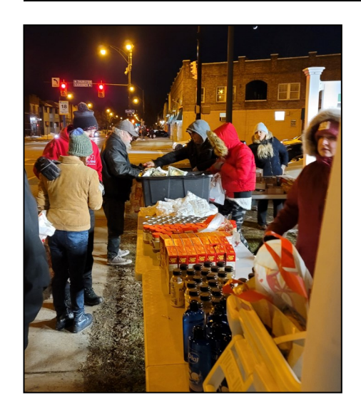
It was a cold night on Chili Avenue.