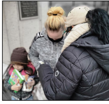
A little girl clutches her new children's Bible while a servant prays with her mother on Brown Street.