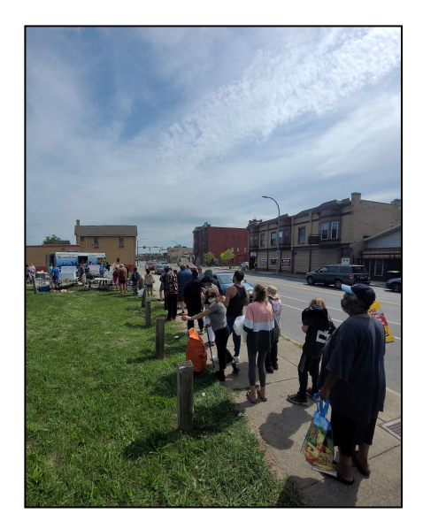
A long line for groceries.

to the one wearing the fine clothes and say to him, 'You sit here in a good place,' and say to the poor man, 'You stand there,' or, 'Sit here at my footstool' have you not shown partiality among yourselves, and become judges with evil thoughts? Listen, my beloved brethren: Has God not chosen the poor of this world to be rich in faith and heirs of the kingdom which He promised to those who love Him?"