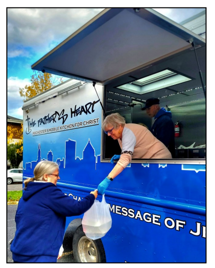
Hot meals to go are served on Hudson Avenue.